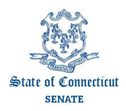
State Senator Rob Sampson 16<sup>th</sup> District