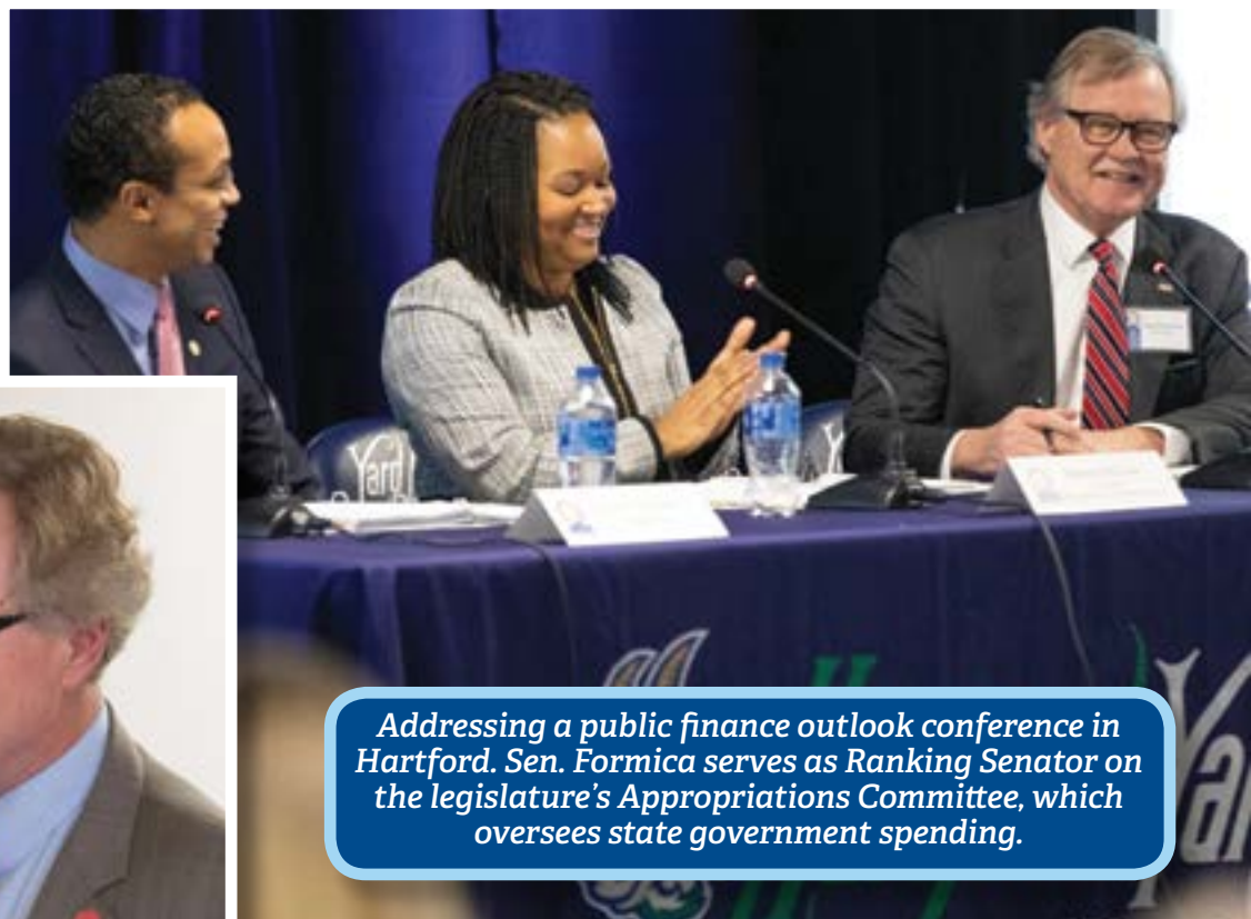
Addressing a public finance outlook conference in Hartford. Sen. Formica serves as Ranking Senator on the legislature's Appropriations Committee, which oversees state government spending.

Protecting Seniors by expanding training for Alzheimer's disease diagnosis and treatment ( Public Act 19-115 ), expanding health insurance coverage for hearing aids ( Public Act 19-133 ), and establishing a Community Ombudsman program to investigate complaints concerning care received by recipients of home and community-based services to help seniors aging in place ( Special Act 19-18 ).