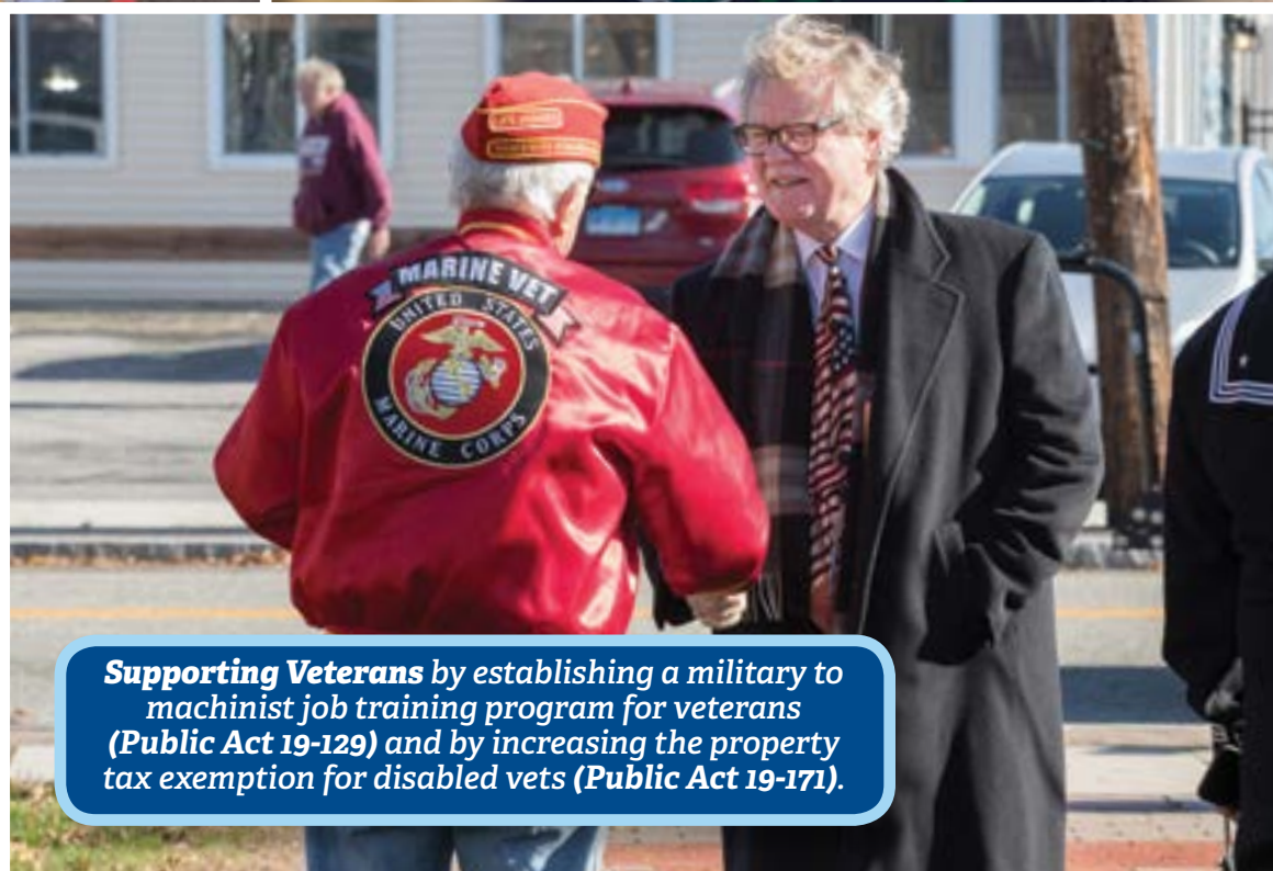
Supporting Veterans by establishing a military to machinist job training program for veterans ( Public Act 19-129 ) and by increasing the property tax exemption for disabled vets ( Public Act 19-171 ).

Preserving the Environment by extending residential solar programs, increasing CT's heating loan program, establishing a "green jobs ladder" and assisting farmers with anaerobic digestion regulations. ( Public Act 19-35 )