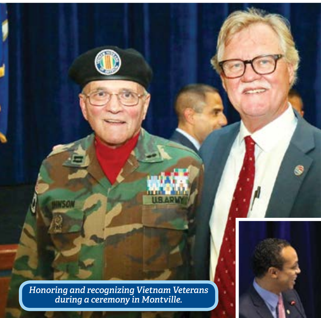
Honoring and recognizing Vietnam Veterans during a ceremony in Montville.

Combating Opioid Abuse by increasing the penalties for the sale of Fentanyl ( Public Act 19-38 ) and establishing new requirements when prescribing an opioid for an extended period of time ( Public Act 19-191 ).