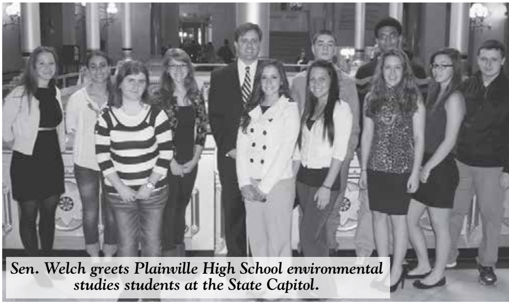
Sen. Welch greets Plainville High School environmental studies students at the State Capitol.