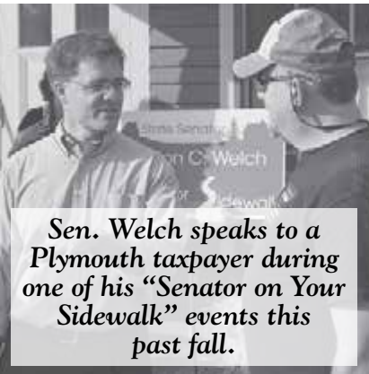
Sen. Welch speaks to a Plymouth taxpayer during one of his "Senator on Your Sidewalk" events this past fall.